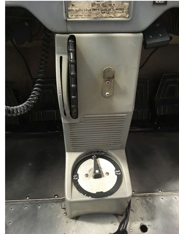
Main fuel shutoff - lower center